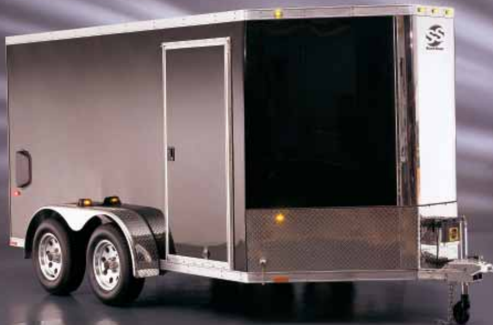
Model SS7122-MT3V (2-Place)

At Wells Cargo we've always preferred to push the envelope, continually searching for better ways to make better trailers. The new SILVER SPORT aluminum motorcycle trailer (MT Series) is a perfect example of that mindset in action. Case in point, the SILVER SPORT 's lightweight aluminum frame. The main rails utilize a reinforced, double-hollow tube design that delivers uncompromising durability. Plus, we made every effort to keep you on the road and not in your garage. Standard features like LED lighting, AlumaSport™ aluminum wheels, bonded smooth exterior skin, seamless aluminum roof, anodized aluminum trim, ATP fenders and ATP stone guard minimize upkeep.