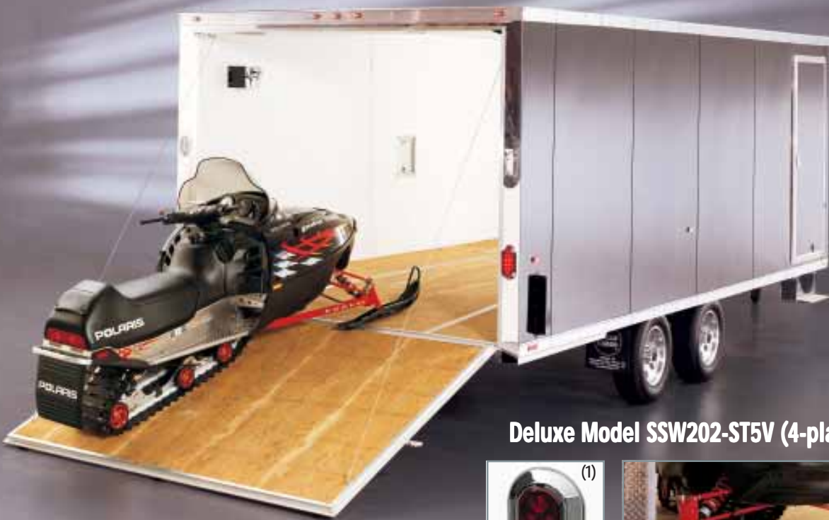
Deluxe Model SSW202-ST5V (4-place)

Choose from two different SILVER SPORT ST Series models: a single axle 2-place and a tandem axle 4-place. See price list for complete specifications.