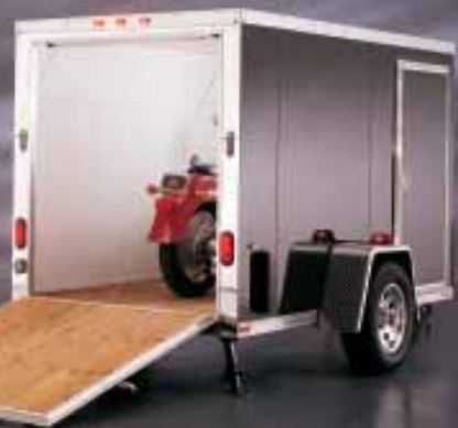
Model SS5101-MT3V (1-Place)

Lightweight, low-maintenance and way beyond ordinary, the SILVER SPORT lets you break free from the pack.